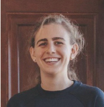
MARY CAIN BOARD DIRECTOR

Mary Cain is a professional runner and founder of the nonprofit and professional running team, Atalanta NYC. Along with focusing on her training, Mary works at Tracksmith as the New York City Community Manager, New York Road Runners.